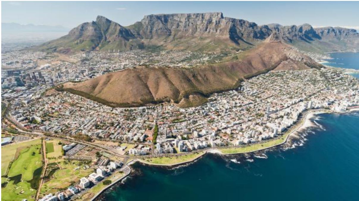
Table Mountain is the most iconic landmark of South Africa. Table Mountain is a natural world heritage site and a Natural New 7 World Wonder of the World .

The mountain gets its name from the fact that it has a flat top which looks like a table. It is often covered in cloud which is known as the 'Table cloth'. It is a significant tourist attraction, with many visitors using the cableway or hiking to the top. You can hike to the top within two hours using one of many different trails , while the cable car just takes a few minutes . The highest point is 1,086 meters (3,563 ft) above sea level.